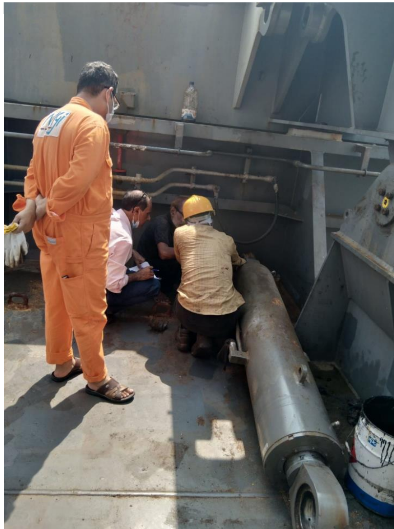
HATCH COVER HAYDRAULIC REPAIR