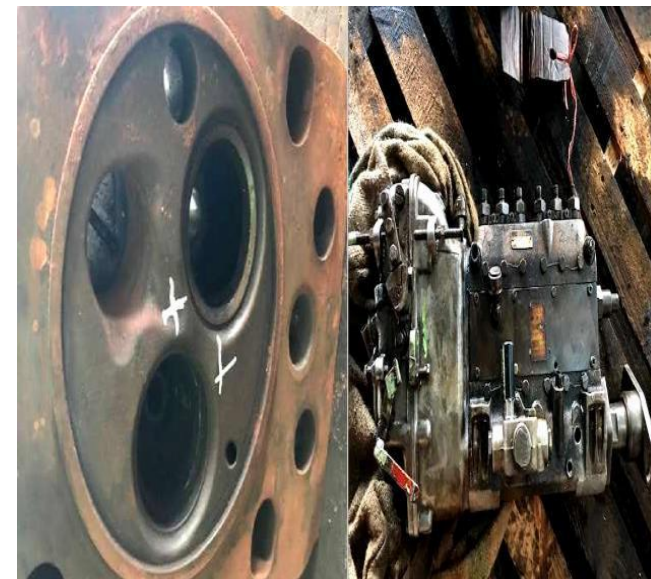
MAIN ENGINE OVERHAULING