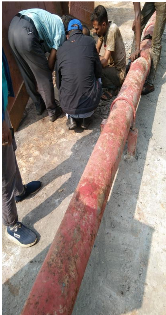
DECK PIPE WORK